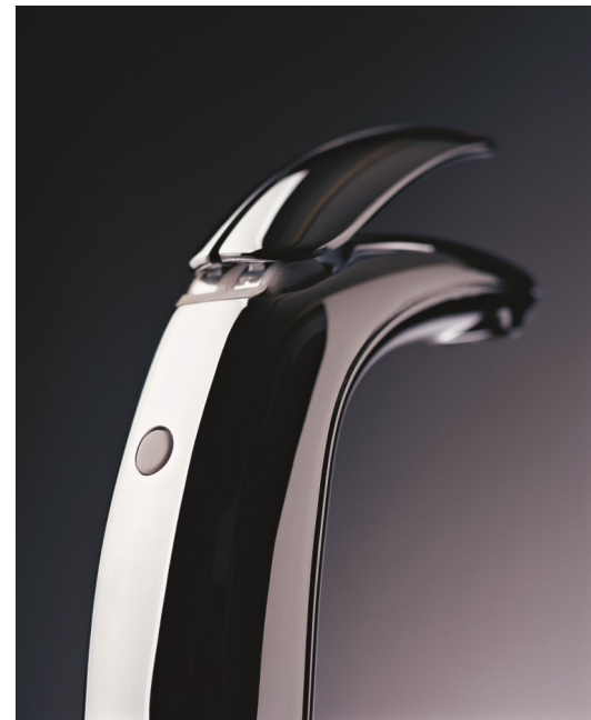
Concealed Safety Switch