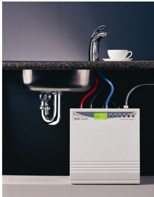
Billi Quadra underbench Module