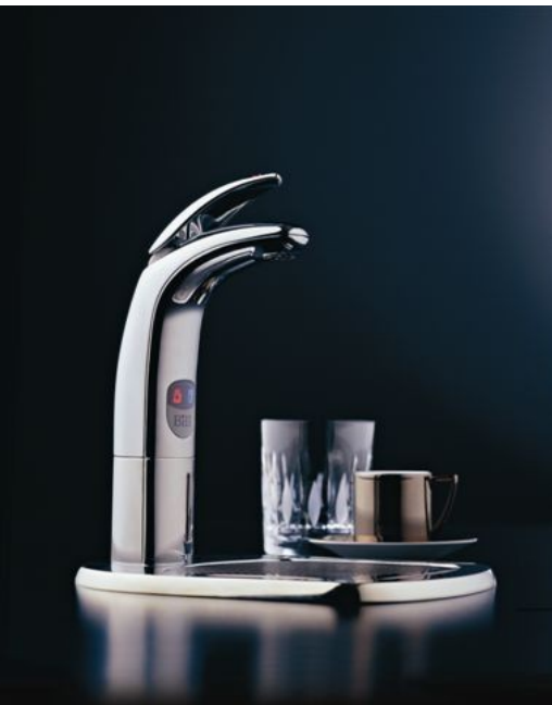
Boiling & Chilled Model pictured on Optional Font