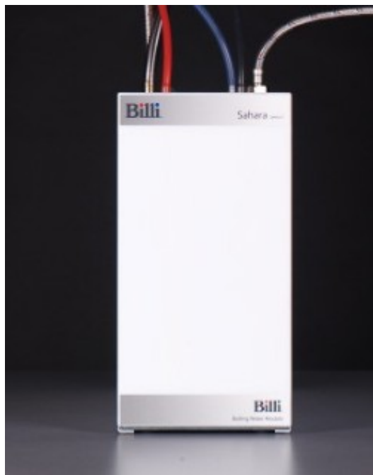
Sahara Underbench Module