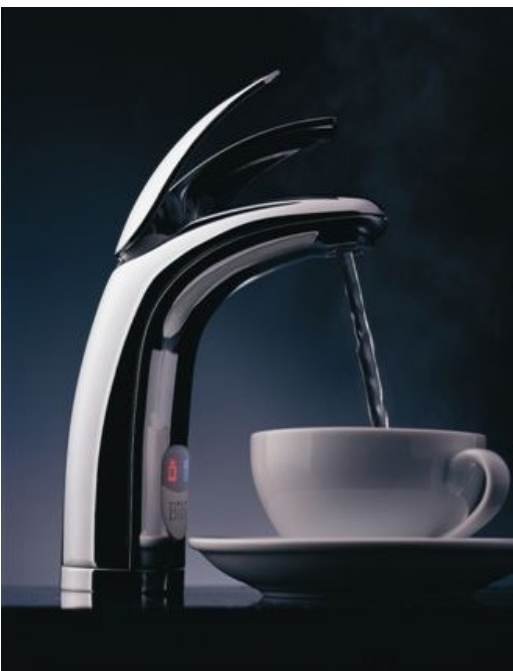
Standard Disabled Compliant Sahara Dispenser