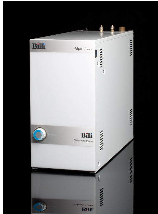
Underbench Module with Easily Adjustable Temperature Control Knob