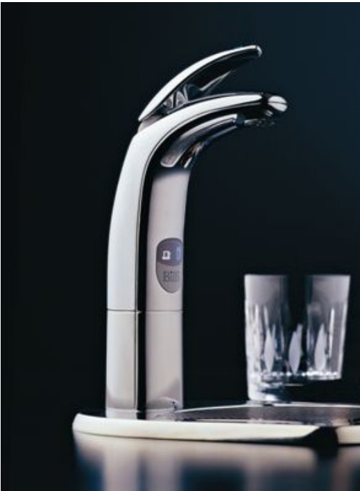
Dual Temp Dispenser pictured on Optional Font.