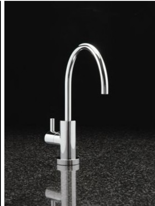
Alpine Slimline Dispenser