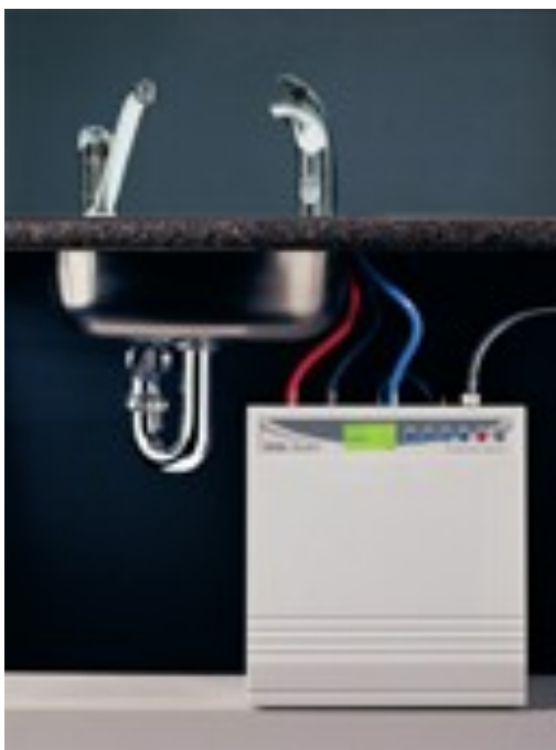
Boiling & Chilled with Sink Mixer model shown. Sink not included.