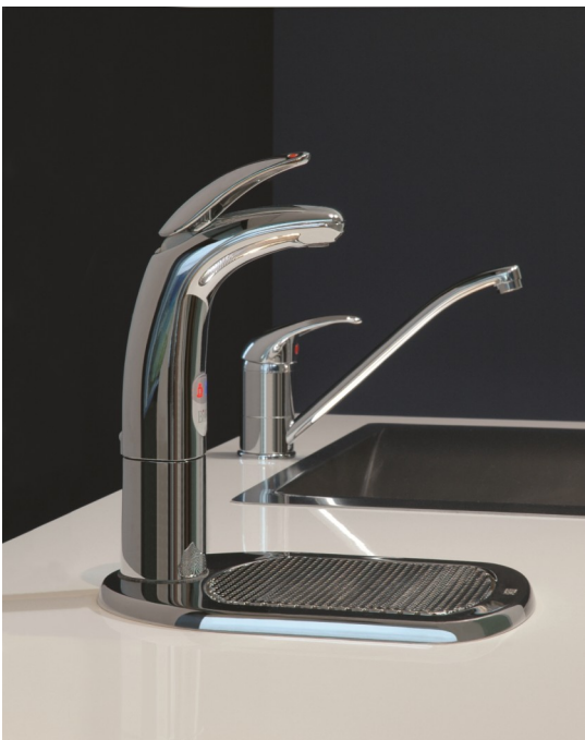
Boiling & Chilled with Sink Mixer model shown. Dual temp dispenser pictured on optional font.