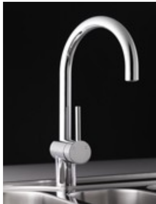
Optional Gooseneck mixer tap.