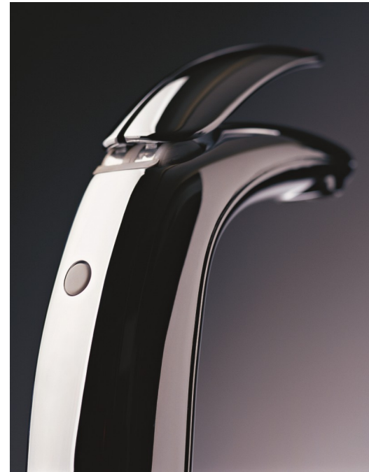
Concealed Safety Switch