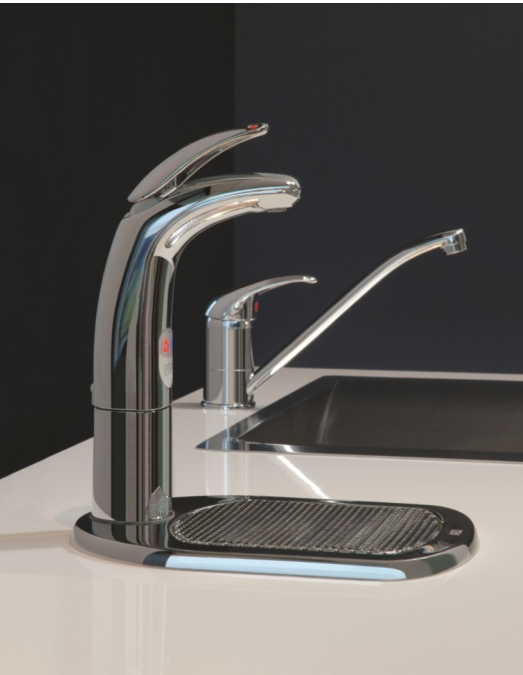
Boiling & Ambient with Sink Mixer model shown. Dual temp dispenser pictured on optional font.

Instant Boiling and Chilled Filtered Water Plus Hot and Cold