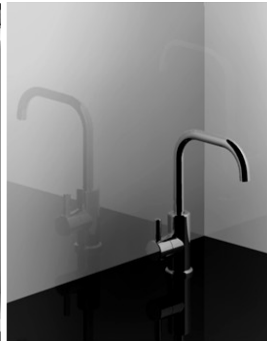
Optional Square Profile Slimline Dispenser