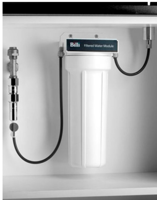
Underbench Filter Module