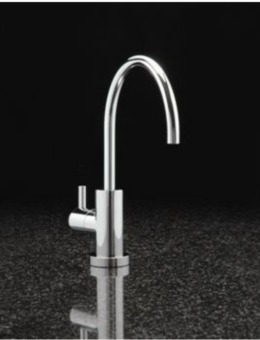
Round Slimline Dispenser