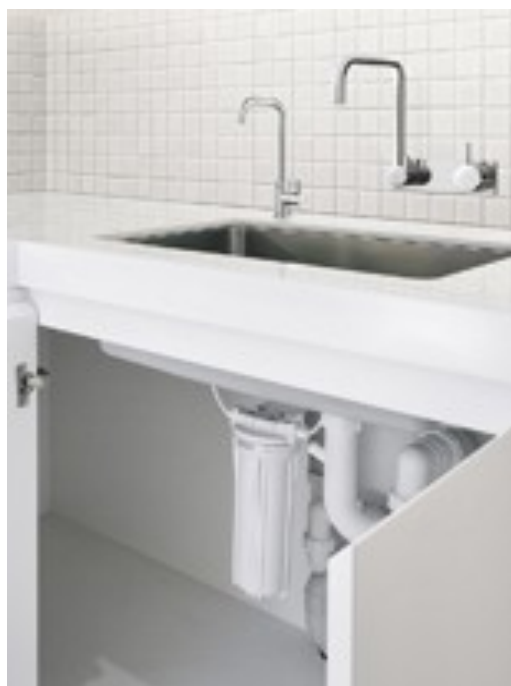
Underbench Single Filter Module