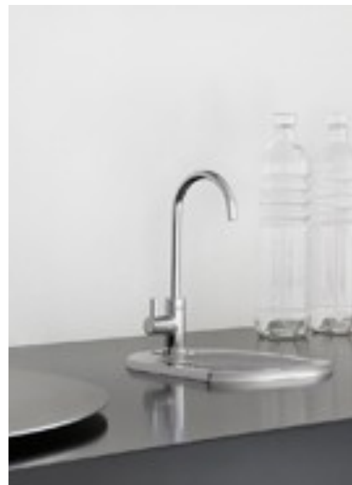
Round dispenser pictured on optional Font.