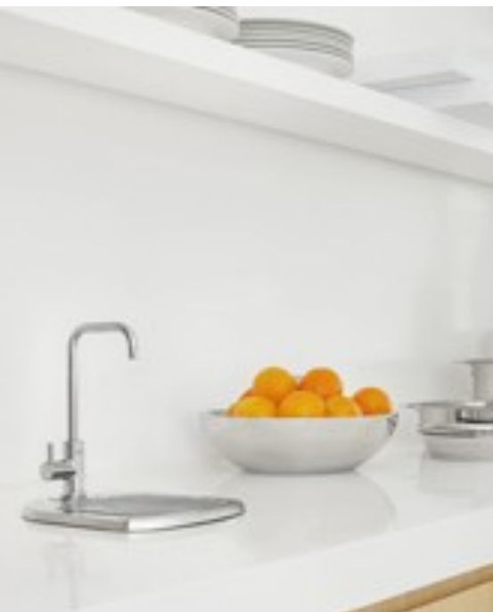
Square profile dispenser pictured on optional Font.