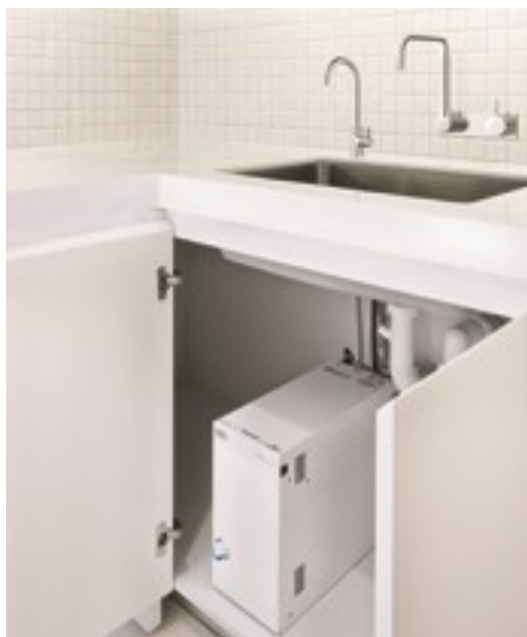
Underbench module with adjustable temperature control knob.