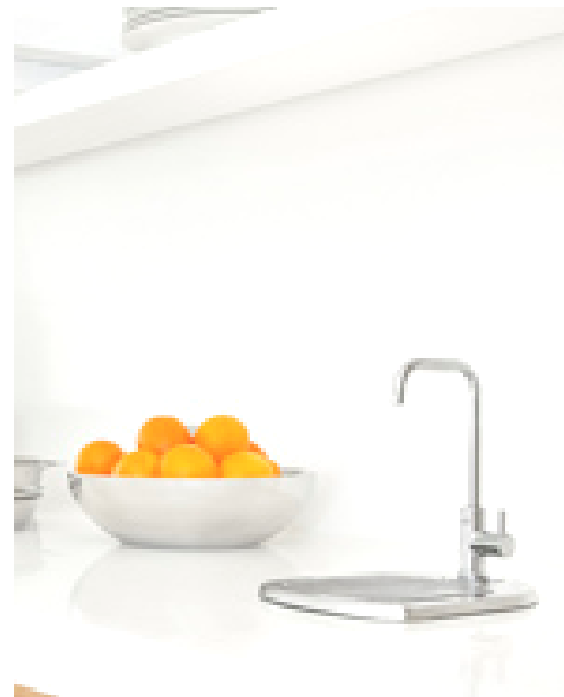
Square profile dispenser pictured on optional Font.