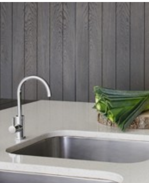
Round style dispenser