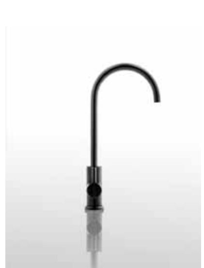
Optional black finish