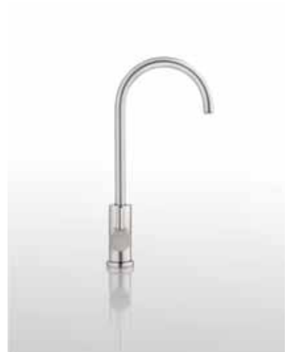
Optional brushed finish