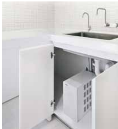
Cupboard space saving

A strong commitment to quality is as important to Billi as style, function and innovation. Recognising the importance of reliability to customers, all Billi water systems are manufactured to strict quality standards and built to last. And every system is designed to provide the highest possible standards of efficiency and energy savings.