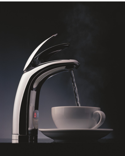
Standard Disabled Compliant Dual Temp Dispenser