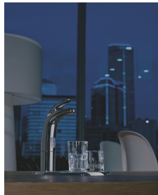
Dual Temp Dispenser pictured on Optional Font.