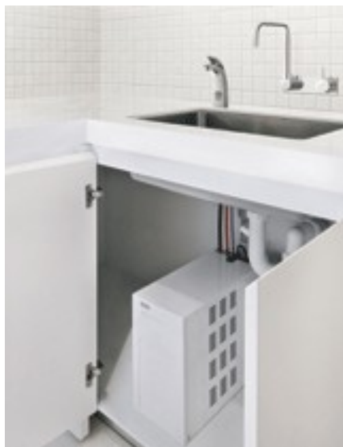
Single Underbench Module