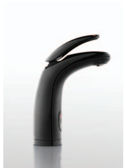
Optional black finish