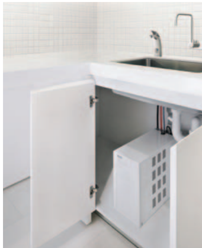
Cupboard space saving

*24-month warranty dependant on installation by Billi service technician.