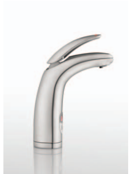
Optional brushed finish