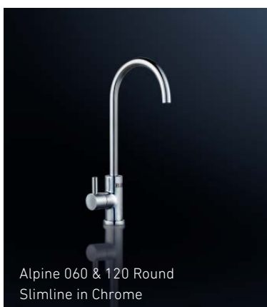
Alpine 060 & 120 Round Slimline in Chrome