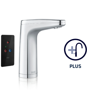
XR Remote Dispenser