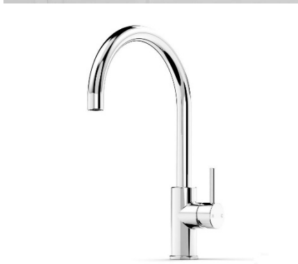
Gooseneck Mixer in Chrome

* To order a square mixer change Product code on page 2 from LP to LG