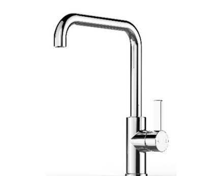
Square Mixer in Chrome

* To order a square mixer change Product code on page 2 from LP to LG