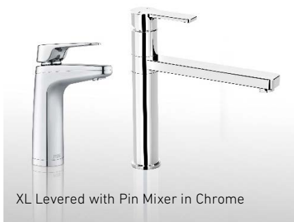
XL Levered with Pin Mixer in Chrome