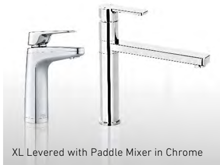
XL Levered with Paddle Mixer in Chrome

Featuring a separate mixer tap complete with its own hot water supply, operating as your hot water service and still providing boiling, chilled and sparkling drinking water.