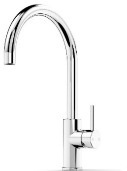
Gooseneck Mixer in Chrome

The new Billi sparkling models have an improved chilling capacity & recovery time. A simple adjustable control knob allows the chilled water temperature to be raised or lowered for chilled and refreshing drinks.