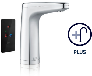
XR Remote Dispenser