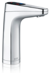
XT Touch Dispenser