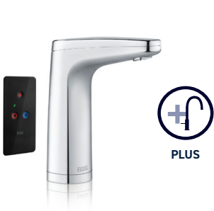
Sahara Under-Bench Unit